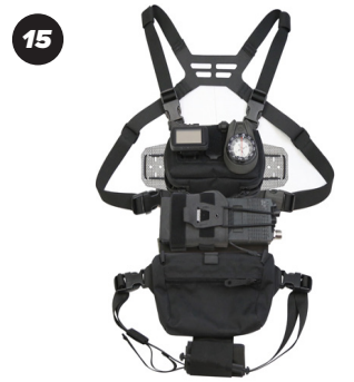
Unbuckle shoulder straps