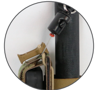
Gear keeper retractable lanyard tethers device to pouch